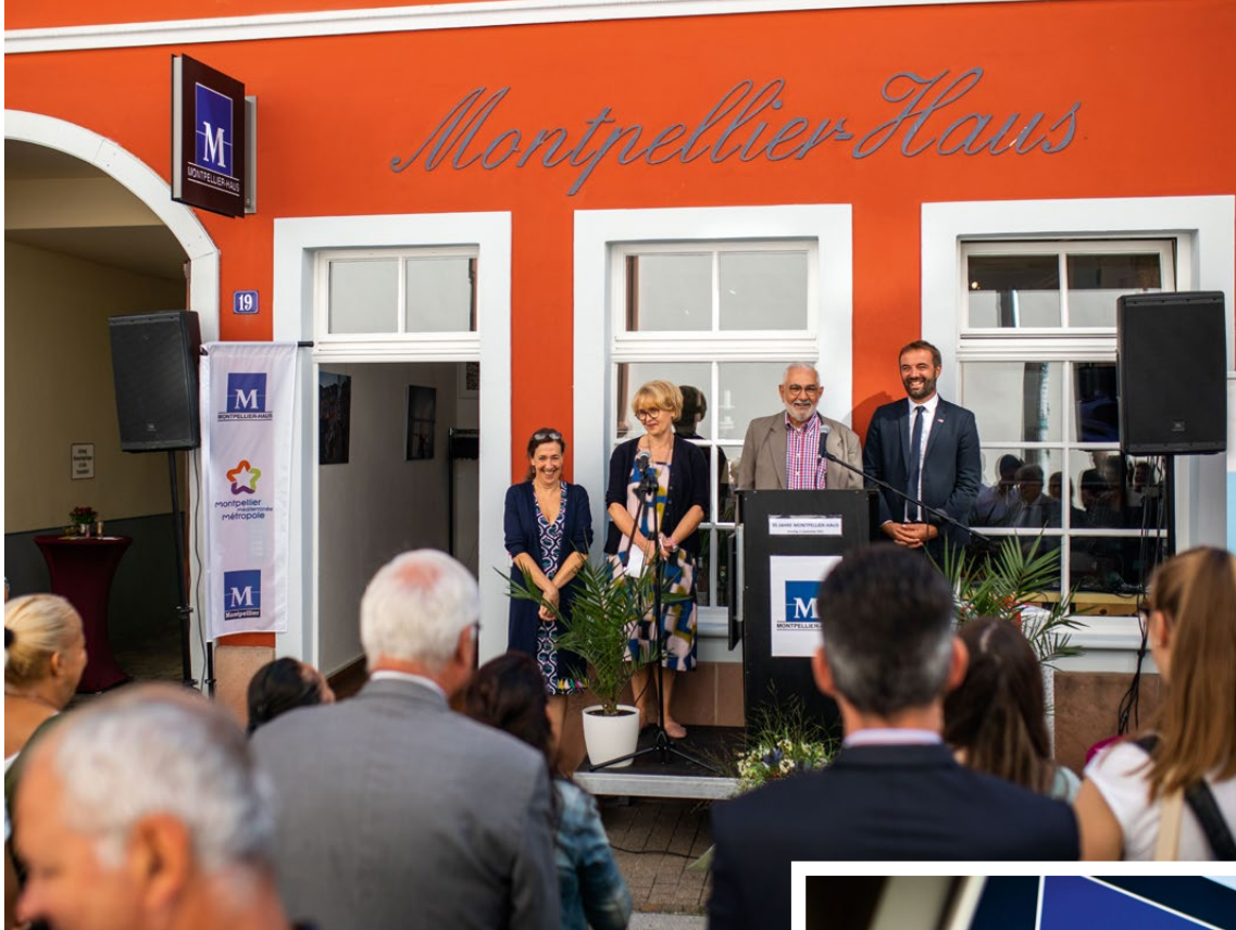
Reception marking the 35th anniversary of Montpellier House, Heidelberg, on 4 September 2021