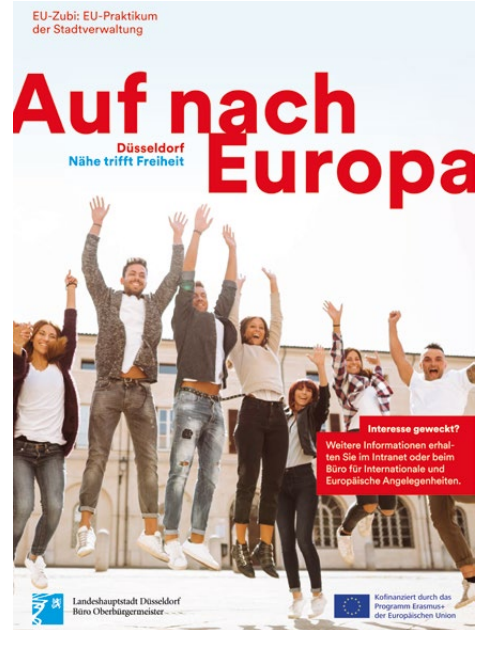
A poster by the city of Düsseldorf advertising internships under the EU-Zubi programme

Since 2019, trainees from the state capital of Düsseldorf can now take part in the ERASMUS+backed "EU-Zubis" public administration training programme, which promotes internships in other European countries. To a limited extent, internships outside Europe are also eligible for support. One objective is for trainees to get an insight into foreign approaches to governance, and to hone their language, professional and intercultural skills. Another aim is to build a network of internationally experienced and interculturally competent city officials. Stays abroad can last from several days to several weeks. The programme is strengthening Düsseldorf's internationalisation efforts and its transnational networks.<sup>30</sup>