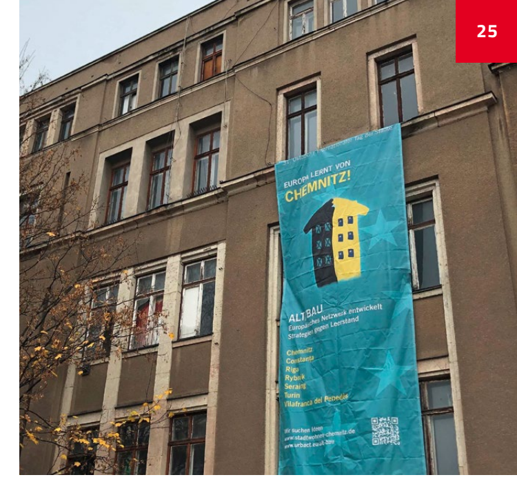
A banner on an old residential building in Chemnitz, lead city for the EU URBACT programme

The housing agency StadtWohnen Chemnitz helps to re-purpose old, vacant, decaying buildings. Recognised as an URBACT Good Practice in 2017, the Chemnitz model is now being scaled up to other cities through the European ALT/BAU Transfer Network. Over half of this EU project funding totalling EUR 490,000 is going to the City of Chemnitz as lead partner. Thanks to this financial influx, Chemnitz has been able to strategically restructure the way it manages its old residential buildings, boosting the city's reputation across Europe. Having grown its profile locally, the project succeeded in recruiting actors willing to continue collaborating in this field even after the URBACT network shuts down.<sup>35</sup>