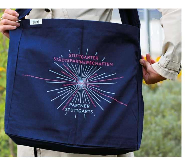
A made-in-Mumbai Fairtrade cloth bag with the emblem for Stuttgart's ten sister cities