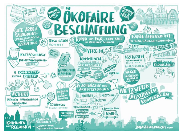
Documenting a conference on eco-fair procurement in the City of Münster

As part of the joint initiative "1000 schools for our world", municipalities solicited donations for a project to build schools in countries of the Global South.