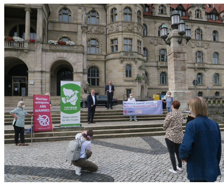
Mayor Belit Onay gives a speech in front of the new town hall in Hanover on the occasion of the 2021 Mayors for Peace Flag Day

The state capital Hanover has been actively engaged in the global Mayors for Peace alliance since 1983. The goal: a world without nuclear weapons. Hanover is Germany's vice-president city, executive city and lead city for this initiative. Extensive outreach campaigning, discussion events on security topics, regular exchanges with the German Federal Foreign Office (AA), international youth encounters, participation in international conferences, and intensive networking in the European Chapter of Mayors for Peace are all ways in which Hanover engages in advocacy at the national, European and international level. By being part of this network, more than 700 municipalities in Germany are making an important contribution to preserving peace in the world.<sup>10</sup>