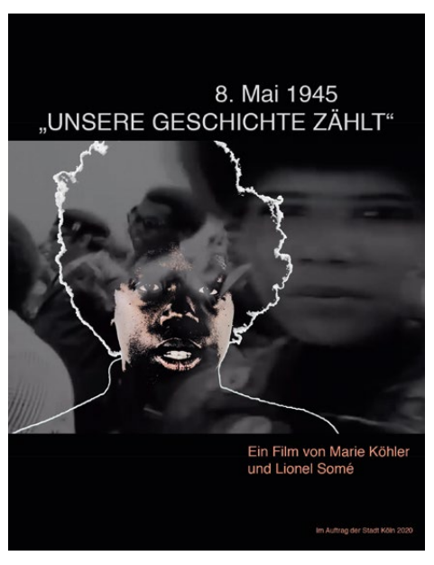
The film "8 May 1945. Our history matters" invites audiences to consider the Second World War from various perspectives