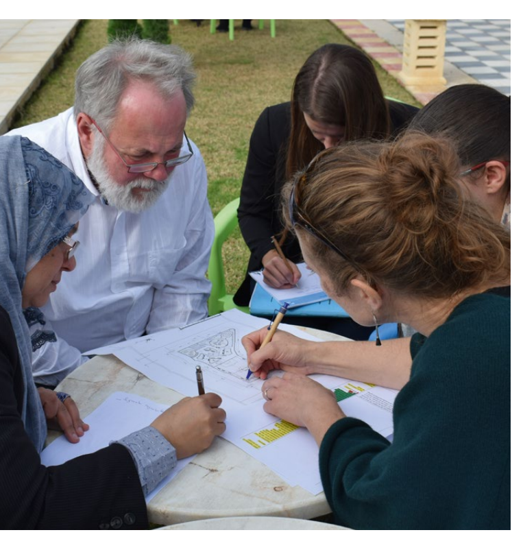
Professionals from the cities of Wolfsburg and Jendouba plan a district park in Jendouba, Tunisia.

Wolfsburg and Jendouba kick-started their development partnership by co-designing a neighbourhood park in a district of Jendouba. The professional exchanges and official meetings that ensued between the two sides saw the district park completed by January 2020 and a city-to-city partnership underway.