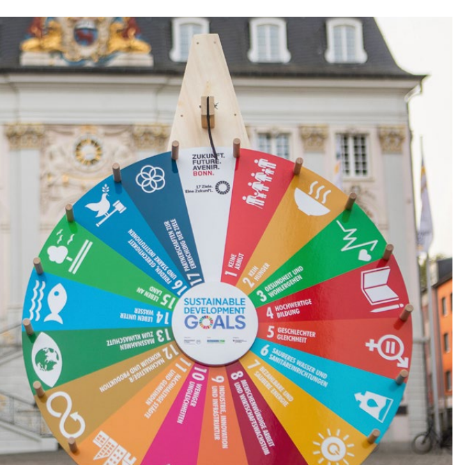
SDG Wheel of Fortune in front of Bonn's town hall

The 17 Sustainable Development Goals adopted by the United Nations