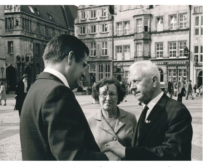
Hans Koschnick, Bremen's former mayor, President of the Bremen Senate and, from 1971 to 1977, President of the Association of German Cities, talking to a couple from Gdańsk. The man on the right was born in Bremen in 1909 as the son of a Polish weaver; the family relocated back to Poland in 1919.

Founded in 1976, the Bremen-Gdańsk city-tocity partnership was the first between Poland and West Germany. From its outset, its salient features have been solidarity and joint engagement for peace, democracy and human rights. In 1981, for example, a delegation of Gdańsk port workers on a trade-union exchange found themselves stranded in Bremen following the declaration of martial law back home. Forced into exile, they founded the first foreign-based Coordinating Office for Solidarność in Bremen with the city's support. Today, public discourse by Bremen's mayor and Gdańsk's Senate President focuses on topics such as the rule of law, citizen participation and women's rights. A partnership between Bremen's Christopher Street Day (CSD) organisation and the LGBTQ group "Tolerado" is the most recent initiative helping to promote liberal values.13