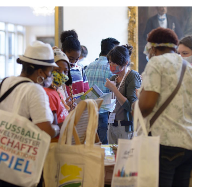
Impression of Frankfurt's annual Newcomers Festival

Frankfurt am Main has always thrived on exchanges with other countries and cultures. Today, the city is home to around 180 nationalities. This diversity is reflected in the city's 13,000 or so foreign companies and approximately 100 consular representations. Frankfurt supports the consulates on a wide range of matters, including information about pre-school places or election procedures. The city hosts multiple networking and information services for all new arrivals, such as the meet&mingle event known as the "International Stammtisch", receptions for new residents, and the Newcomers Festival. Germany's very first Office for Multicultural Affairs (AmkA), which deals with matters of diversity, integration, migration and anti-discrimination, has been fostering intercultural cohesion since 1989.27